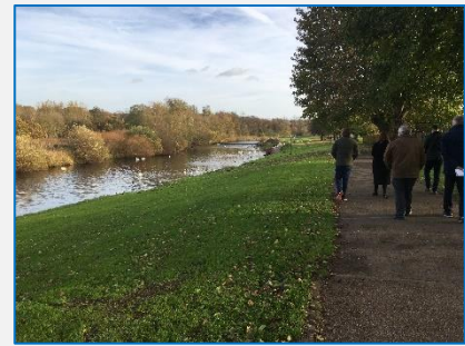
Visit to Riverside Park, Chester-le-Street

The Committee felt that the identified anti-social behaviour problems can be alleviated through further investment in security measures and better management of access points, vehicle controls and greater staff presence. The Committee acknowledged that whilst the improvements may require some initial 'invest to save' funding, there would be savings in ongoing repairs and maintenance which can be offset against these initial, up-front costs. Improvements to the security of the park would also make it a safer environment for park users and prevent further damage.