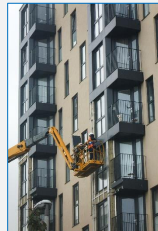
Cladding removal at Kennedy Gardens, Billingham

As well as receiving evidence from key Local Authority Officers, Thirteen Housing Group representatives and senior Cleveland Fire Brigade personnel, the Committee also visited Kennedy Gardens (Billingham), the three tower blocks which were found to have been partially covered with combustible cladding. This gave the opportunity for Members to view the blocks' fire safety measures, and hear from residents directly on the response of local partner agencies following the Grenfell Tower fire, and the discovery of combustible cladding. During the visit, Members witnessed the ongoing removal of the partial cladding.