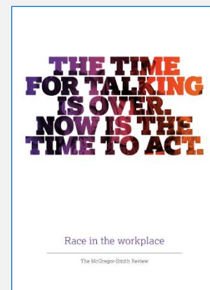
McGregor-Smith Review (2017)

A number of recommendations were put forward by the Committee which aimed to address the issue of undeclared ethnicity of Council staff, variances of BME representation across Council directorates, and senior management responsibility in promoting diversity. Further key recommendations included the need for the Council to increase awareness of what it does and its potential employment opportunities, a campaign promoting the diversity of the Council’s staff and the roles they undertake, and an endorsement of the draft BME Staff Forum Action Plan.